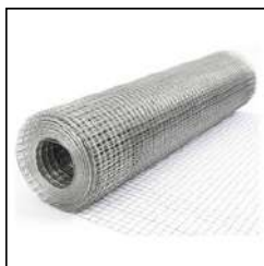
Hot Dipped Galvanized